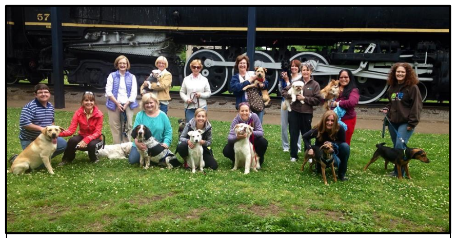
Foster parents with their adoptable dogs on a socialization walk.

Agape Animal Rescue has a continuous need for quality foster homes for our rescue dogs. We are looking for all types of foster families, including those who are able to foster full-time as well as for just a few weeks at a time.