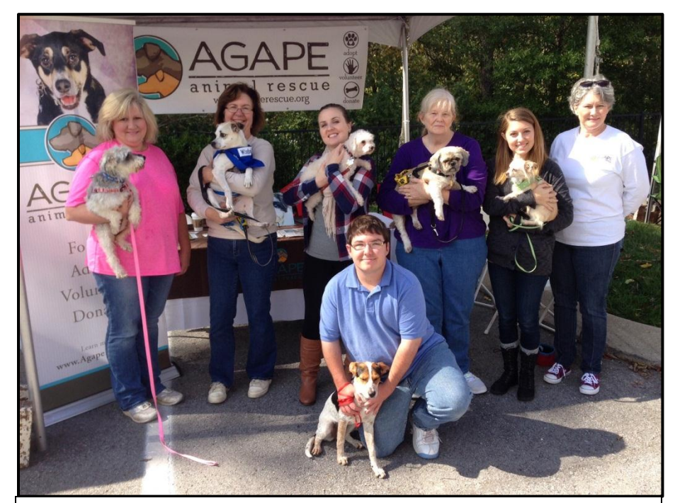
Agape volunteers and foster parents with our adoptable dogs at the annual Mars adoption event.

walking, watering, playing with the dogs, and introducing the dogs to potential forever families.