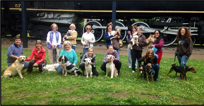
Foster parents with their adoptable dogs on a socialization walk.

Agape Animal Rescue has a continuous need for quality foster homes for our rescue dogs. We are looking for all types of foster families, including those who are able to foster full-time as well as for just a few weeks at a time.