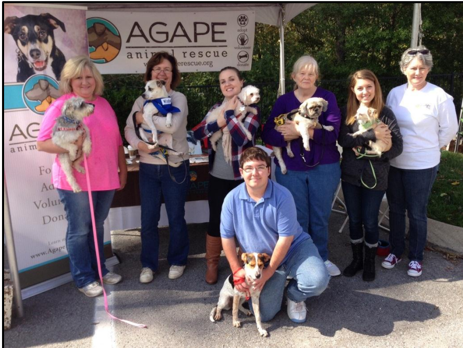
Agape volunteers and foster parents with our adoptable dogs at the annual Mars adoption event.

walking, watering, playing with the dogs, and introducing the dogs to potential forever families.